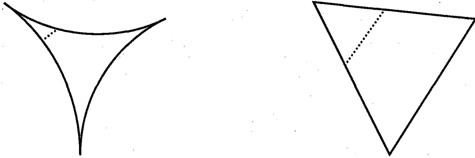
Figure 3.1: Comparison triangles for the CAT(0) inequality

Proposition 3.2.7. A cubical complex (with the Euclidean metric on each cube) is locally CAT(0) if the link of each vertex is a flag simplicial complex (see Definition 3.2.4).